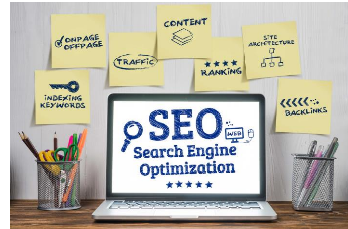
Image: SEO - Search Engine Optimization